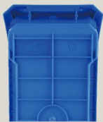
Reinforced ribs on bottom